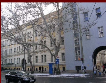
The Hungarian Studies Building

Saturday: Excursion to Hódmez vásárhely , with György E. Szönyi