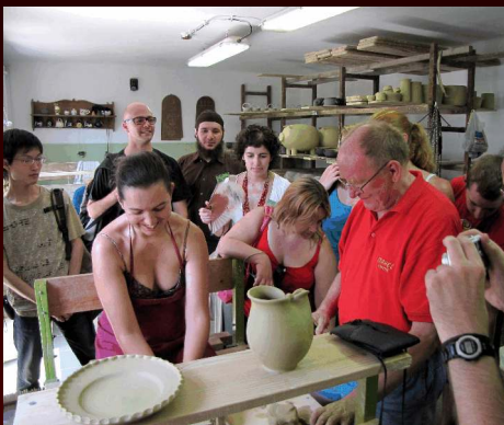
Field Trip at Our Potter