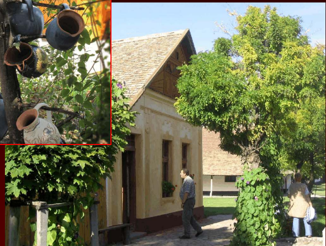
Ópusztaszer, Museum Village