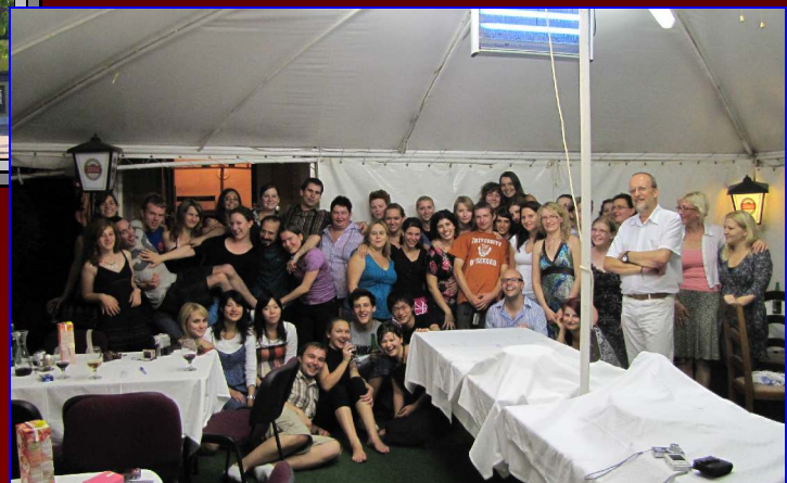
Graduation Party, 2009