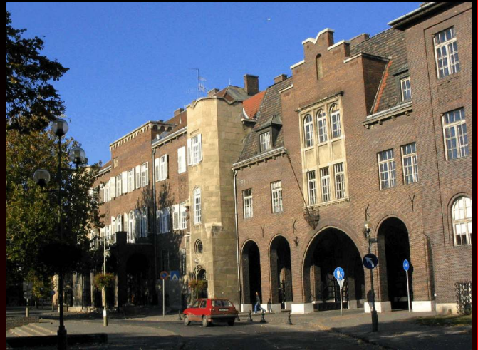
University Buildings in the City Center