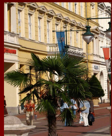
In Mediterranean Mood